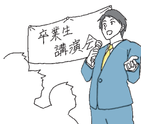
Voices from Graduate Students

Close interaction between students and faculty members support high-quality education