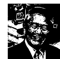
Purdue University Distinguished Professor Mr. Ei-ichi Negishi (Teijin Group Distinguished Fellow) 5th year Teijin Kumura scholarship (1957)

When you find your own "Dream", please challenge it thoroughly until the truth is investigated. I look forward to your great success in the future.