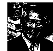
Purdue University Distinguished Professor Mr. Ei-ichi Negishi (Teijin Group Distinguished Fellow) 5th year Teijin Kumura scholarship (1957)

*This message was contributed in November 2013.