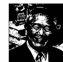
Purdue University Distinguished Professor Mr. Ei-ichi Negishi (Teijin Group Distinguished Fellow) 5th year Teijin Kumura scholarship (1957)

When you find your own "Dream", please challenge it thoroughly until the truth is investigated. I look forward to your great success in the future.