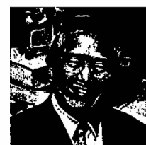
Purdue University Distinguished Professor Mr. Ei-ichi Negishi (Teijin Group Distinguished Fellow) 5th year Teijin Kumura scholarship (1957)

When you find your own "Dream", please challenge it thoroughly until the truth is investigated. I look forward to your great success in the future.